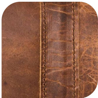
Difference in structure